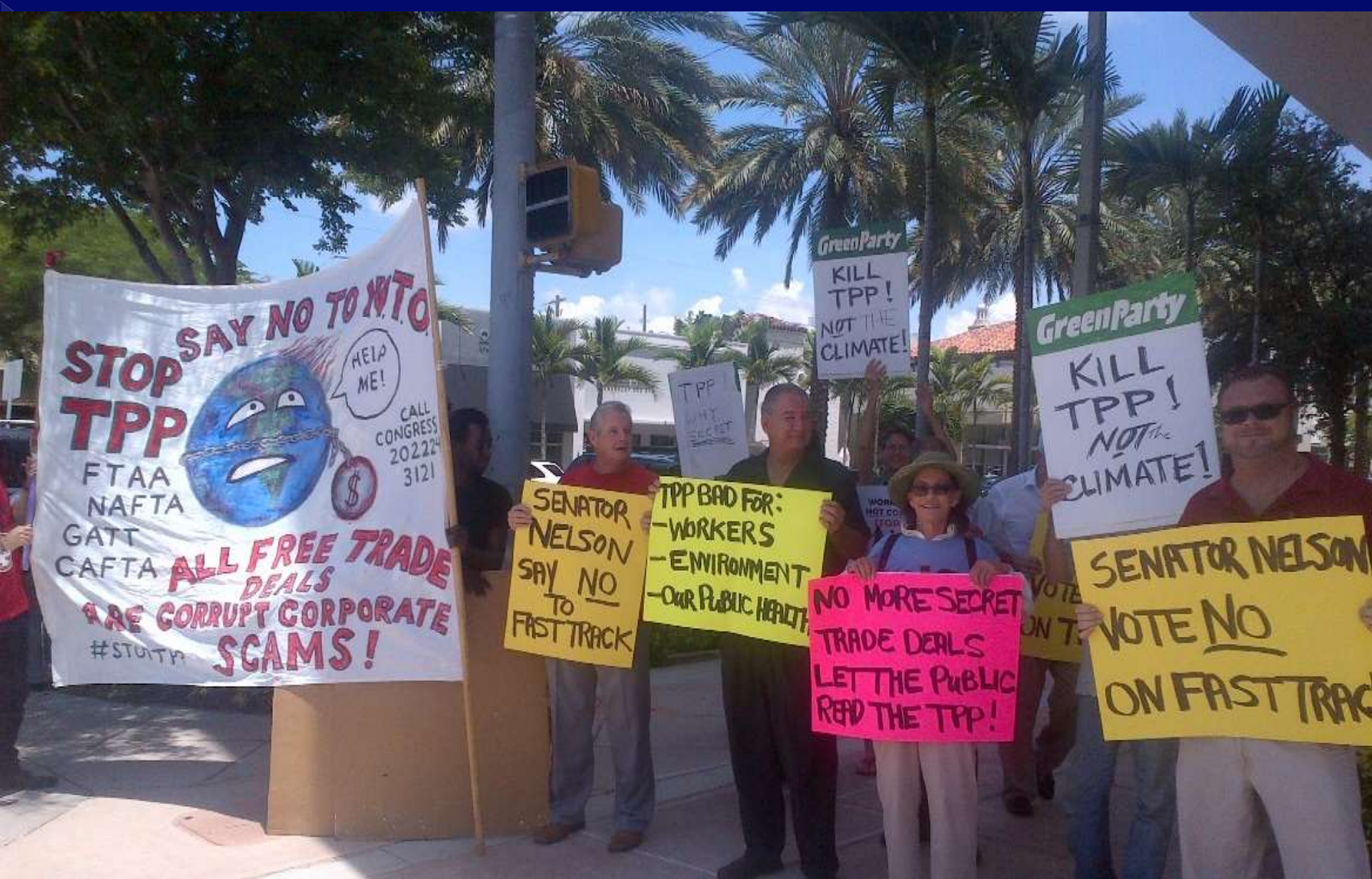
6/22 Rally and protest at Senator Nelson's office in Miami with a petition drop of 8,000 signatures opposing Fast Track and TPP. CTC, CWA, and other partners. NPR and Channel 41 covered the event.