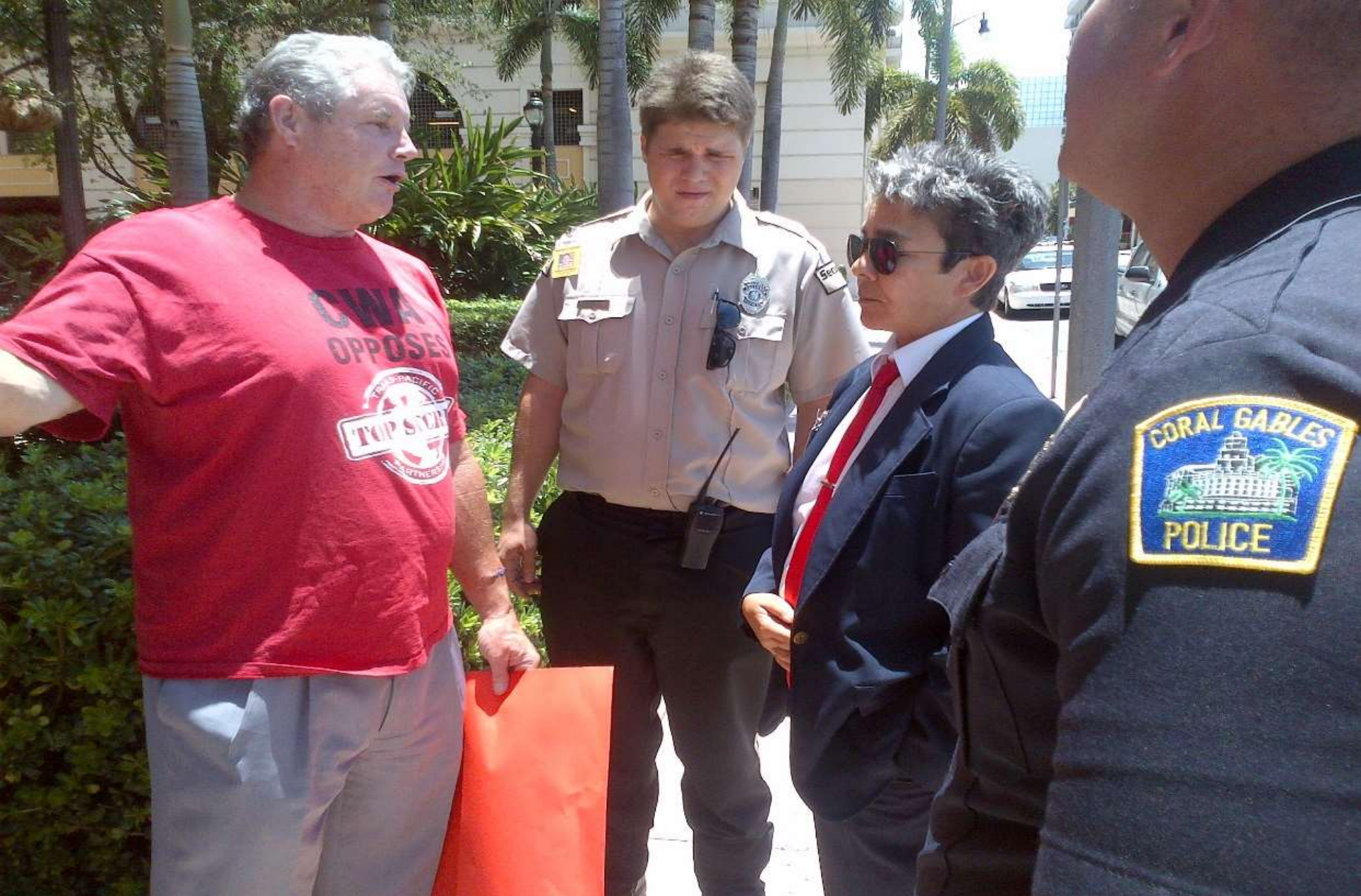
CWA and other coalition partners rallied, but were not allowed inside some buildings during petition deliveries.