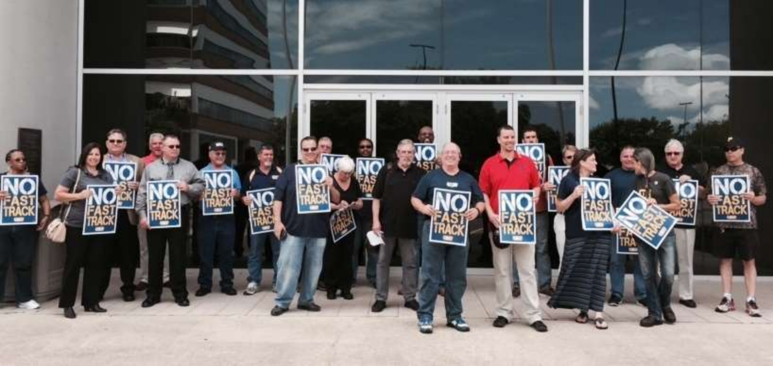
New Orleans Stop Fast Track gathering at Rep. Cedric Richmond's office May 7 with United Steel Workers, NOLA MoveOn Council, and other groups.